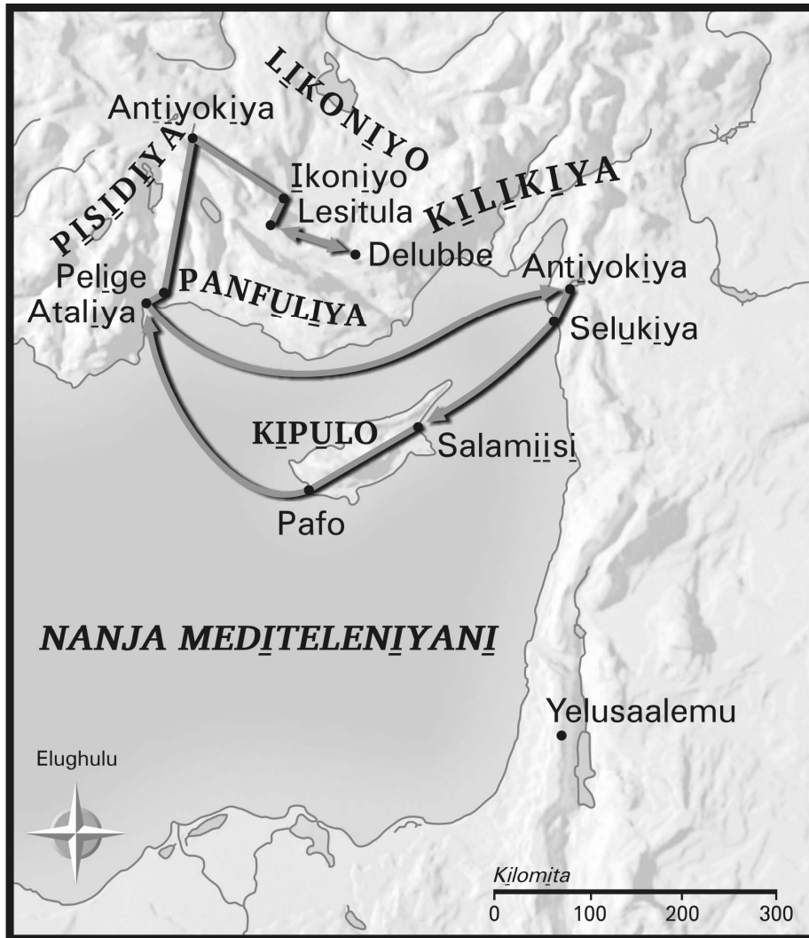
Maapu 1: Lughendo lwa Paulo lwokudubha (Bikoluwa 13, 14)

Kwekomelamu. Ote mu kaabbokisi nkuukamu eghi ehikiye.